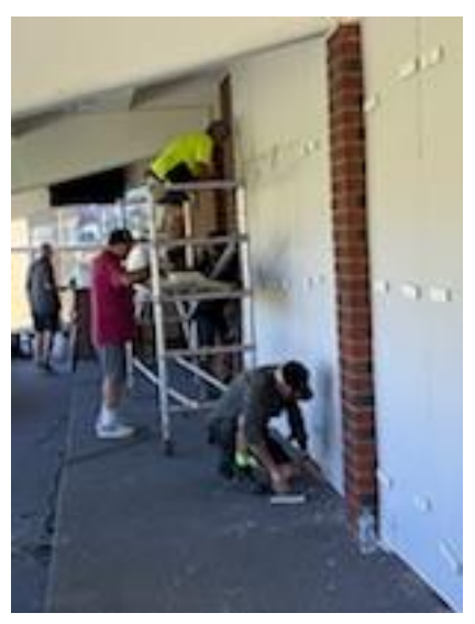
Two bays down one to go