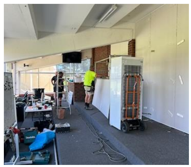
The final push, half a bay to go