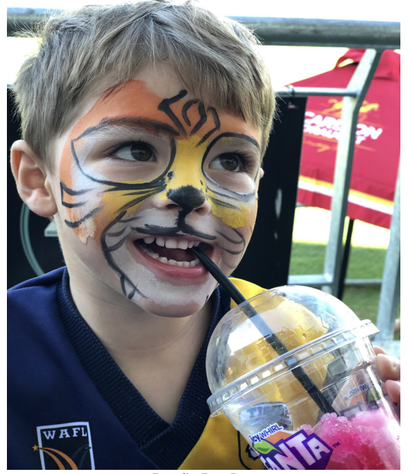
Family Fun Day