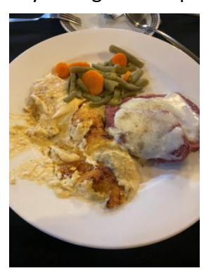
The meal of the night, silverside with potato bake, vegies and gravy, finished off with apple pie and cream, yuuuuummmmmm!!!!!