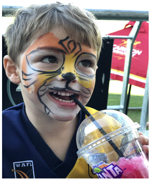
Family Fun Day