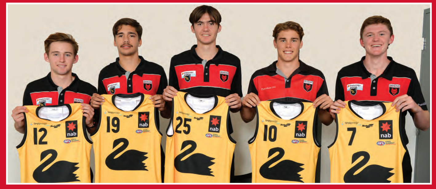
2019 State 18s