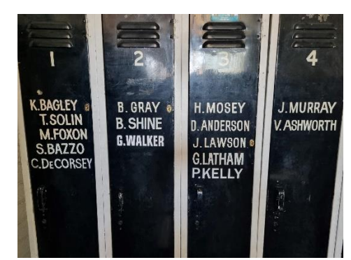
The old lockers, dating back to the 1960's feature 100 game players.