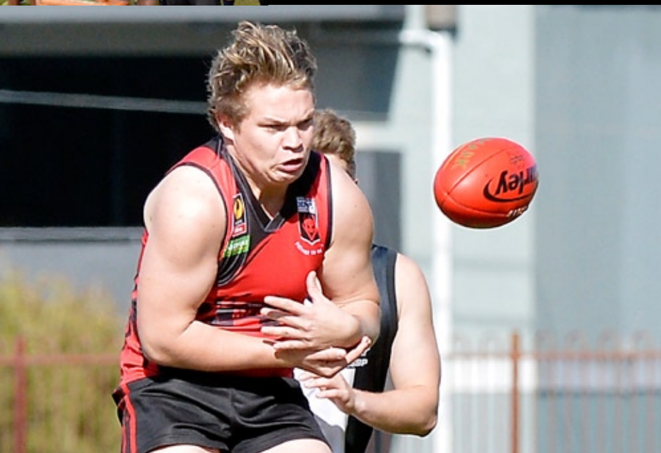
FORMAT WAS CHANGED THIS YEAR WITH ROUND ONE OF THE SENIOR GAMES PLAYED IN THE REGIONS IN JUNE