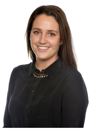
MEMBERSHIP, MARKETING & EVENTS REPORT

Upon commencing my role as the Club's Business Development Officer in January 2016, one of my main priorities was to increase the Club's communication to its Members and Supporters through online platforms such as our Website, Social Media and E-Newsletter.