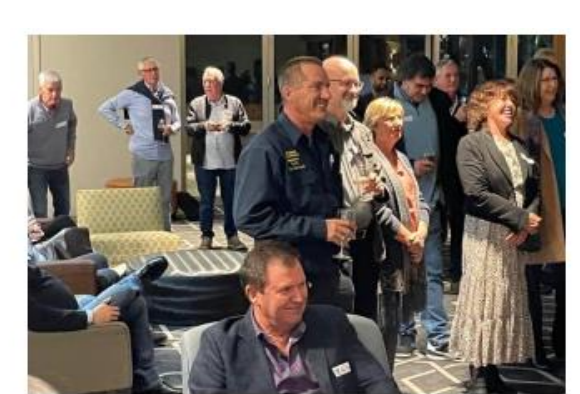
Captivated Audience at the Networking Night