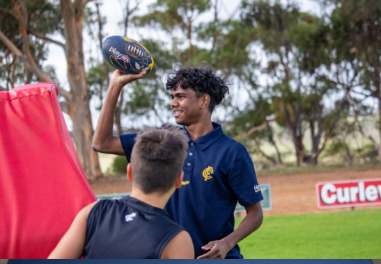
CLAREMONT FOOTBALL CLUB