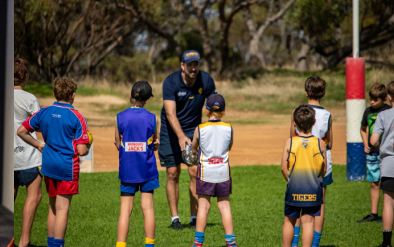
CLAREMONT FOOTBALL CLUB