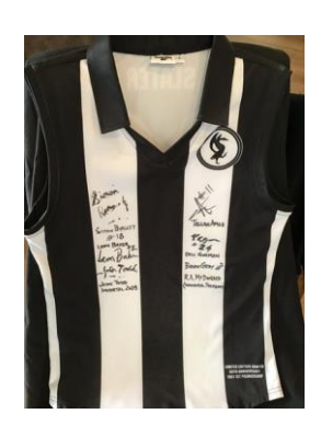
SDFC Hall of Fame Jumper Signed and Framed