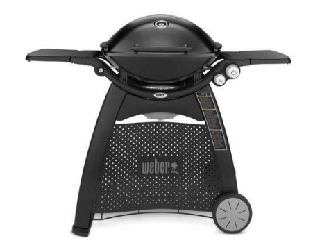
Weber Family Q BBQ (Black)