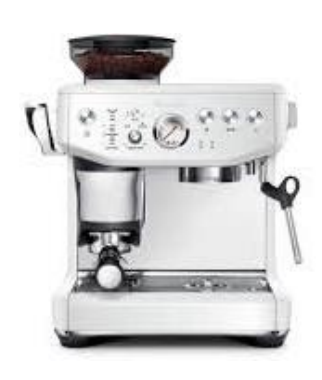
Breville The Barista Express Coffee Machine (Stainless Steel)