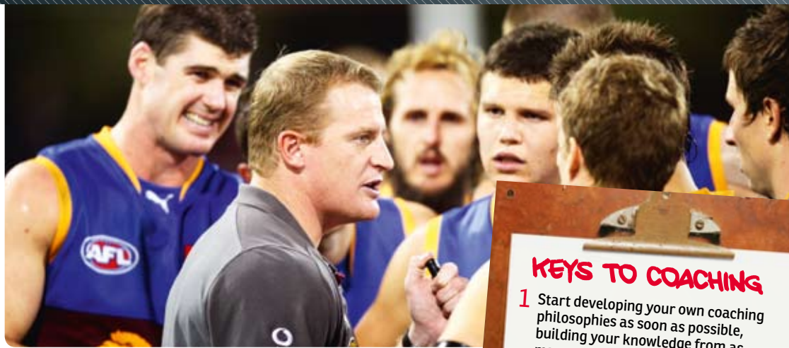
IMPRESSIVE START: Michael Voss has the Lions in fifth place with a 10-6 win-loss record in just his first year as senior coach.

Utilise any past relationship with your players as a positive but be aware of its challenges. I enjoy the rapport I have with the players, which would normally be earned over a long period of time. I can confide in them, seek their opinions and I know they will be honest.