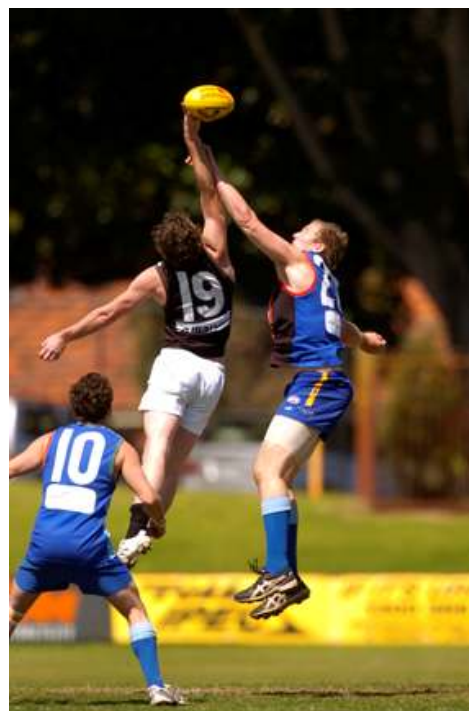
A Reserve Grand Final Wembley v Trinity Aquinas