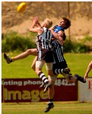
Phil Scott Colts Grand Final North Fremantle v University

The greatest resource in our League is our volunteers. The Board is committed to ensuring that greater support and guidance is provided to our volunteers to ensure that all involved, whether they are committee people, sports trainers, coaches, umpires or bar staff, enjoy their involvement and through their actions continue to support the professional image of the WAAFL.