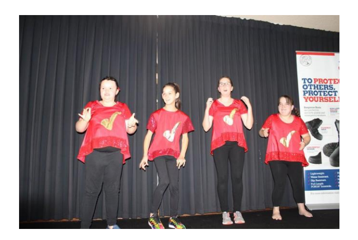
Girls Just want to have fun.

These girls had a great time on Sunday June 11. Entertaining stuff.