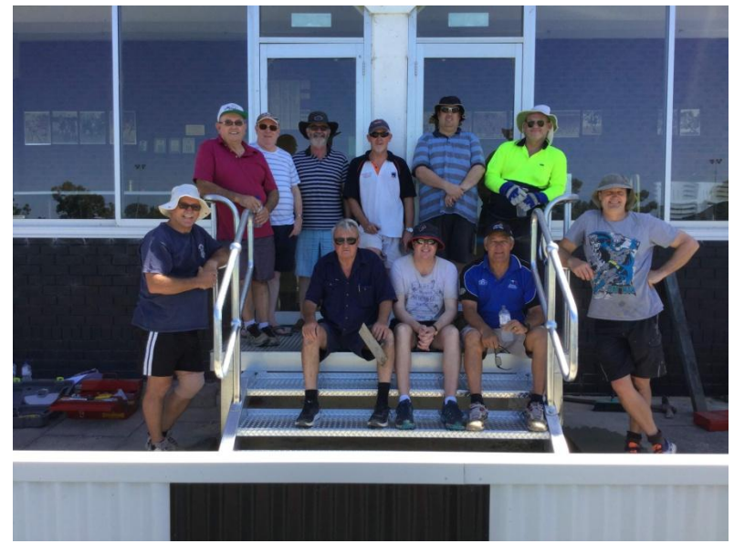
The motley crew of installers